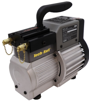
????????? ???????????? CPS Tech-Set™ TR19E