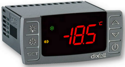
????????????? DIXELL XR70CH-5N0C3